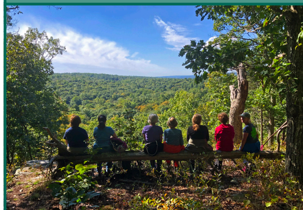
Overlook at Johnston Preserve

Jewett Preserve Johnston Preserve Pleasant Valley Preserve