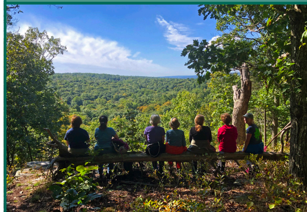
Overlook at Johnston Preserve

Jewett Preserve Johnston Preserve Pleasant Valley Preserve