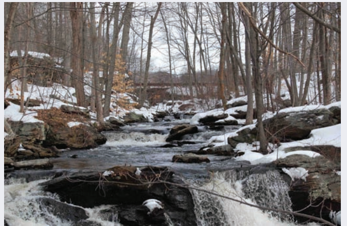
Youth Under Age 15—Kristen Wicander, Moodus