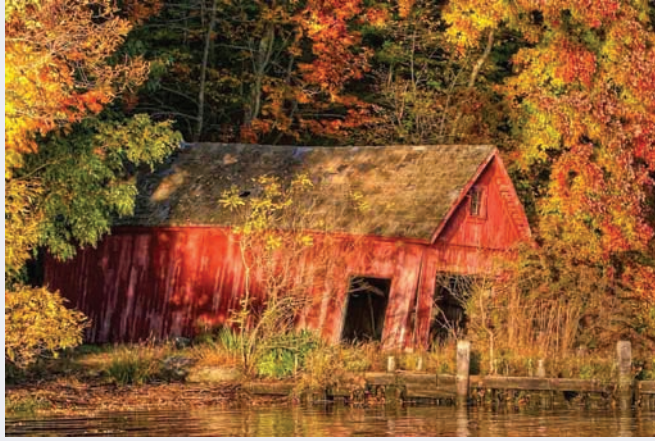
Landscapes/Waterscapes—Carl Buschmann, East Haddam