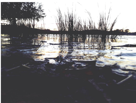
Youth Category: Second Place Grace Vanvliet, Old Saybrook

The 9th Annual Land Trusts Photo Contest winners were announced at a March 6, 2015 reception highlighting the winning photos and displaying all 267 entered photos. Land trusts in Lyme, Old