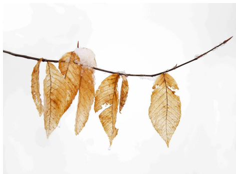
Plants Category: Honorable Mention Erin Reemsnyder, Hadlyme