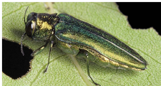
The adult EAB is approximately 1/3 of an inch long.

For more information go to the Connecticut DEEP website at www.ct.gov/deep and use the search function for key word EAB.