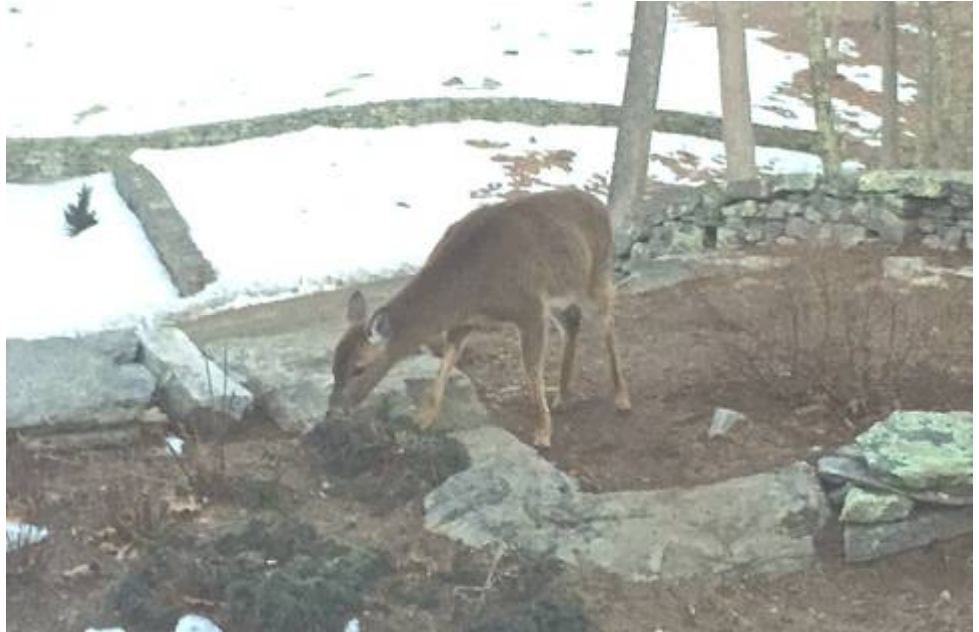
White-tail deer eating ornamental juniper a few weeks ago in a garden on Joshuatown Road in the Hadlyme area of Lyme.

Some plants are simply deer candy. If you must grow hosta, tulips, roses, arborvitae, and most vegetables and fruits, fence them. Constructing a physical barrier is the