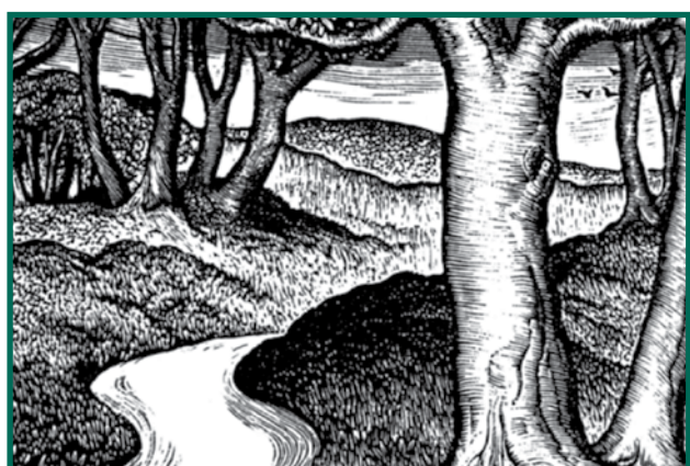
Thomas W. Newsum, The Brook, Fehrer's Greenwald Museum, Lyme Historical Society

The four trails on these properties, White, Yellow, Red and Blue , cover relatively flat terrain over one of the highest points in Lyme. Due to the perched water table, especially near the White Trail , the forest vegetation resembles that more characteristically associated with moist lowlands. Of note are several stands of large tulip poplar trees. Continuing south (and down slope) on the Yellow and Red Trails the vegetation is more typical of dry hilltops. At the southern end of the White Trail are stone ruins that go back to the early 18th century: remnants of houses, barns, sheds, penning areas, and pasture stone walls. There is an additional foundation near the intersection of the Yellow and Red trails. These are significant archaeological sites that can yield important information about our colonial past.